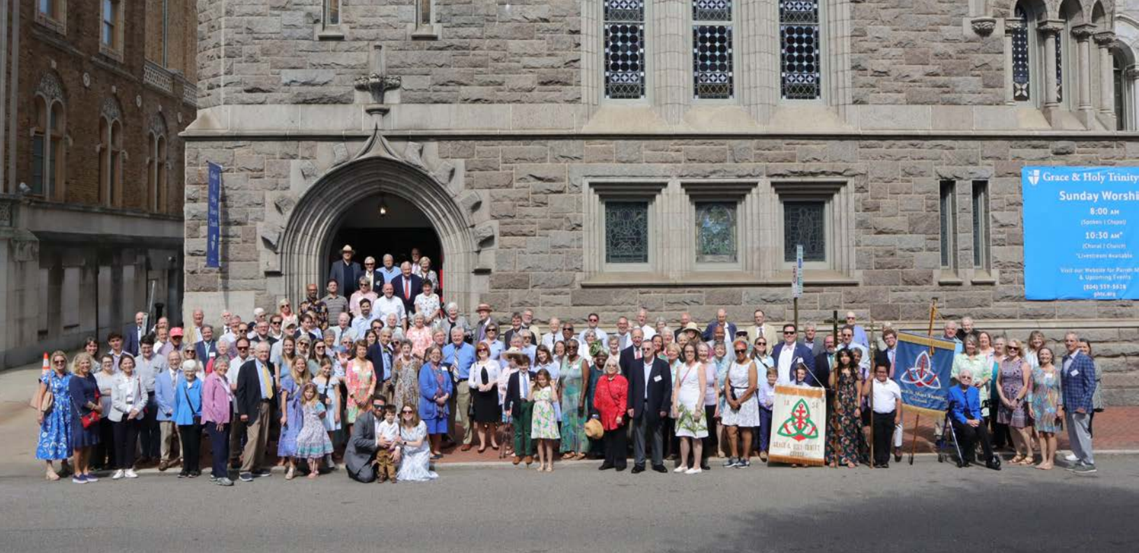
Centennial Celebration Parish Photo