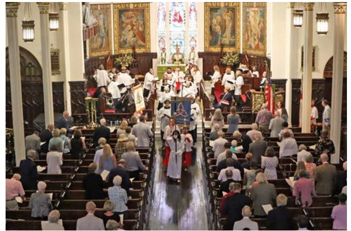
Centennial Celebration Worship Procession Sunday, June 2, 2024

This group is made up of all the ministries who contribute to Grace & Holy Trinity's beautiful and inspirational worship services, from the greeters to the acolytes, and from the lectors to the music. In addition to providing advice to the clergy about Holy Week services, it has taken on two important issues: