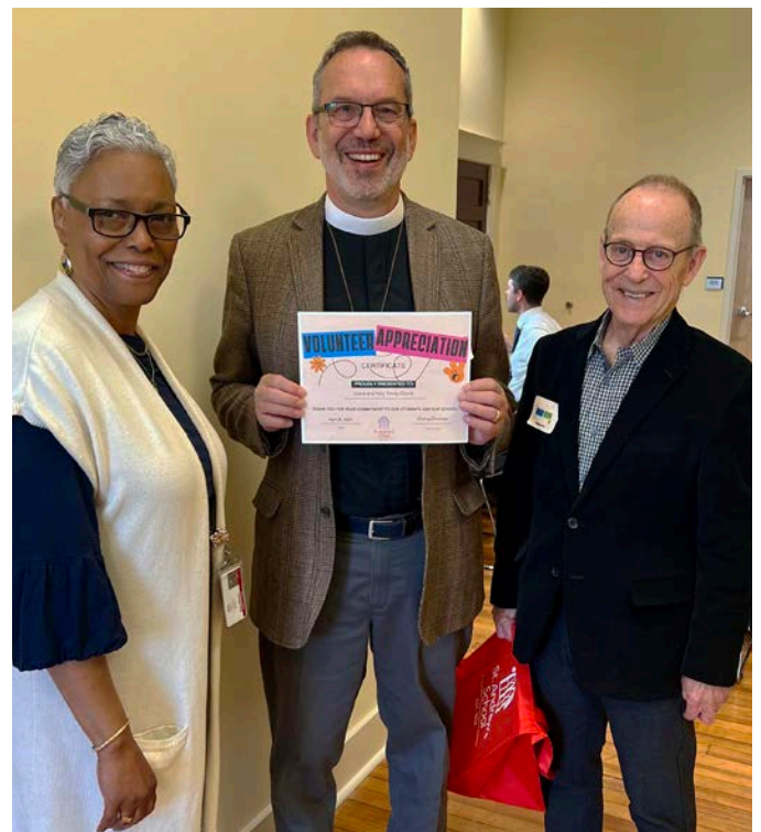
St. Andrew’s School Recently Presenting a Volunteer Appreciation Certificate to GHTC

Door Ministry, St. Andrews School) and far (the Belize Mission Team). Their support also extends to events like Music for a Cause and Caroling in Monroe Park & Holiday Market, to which we invite the community.