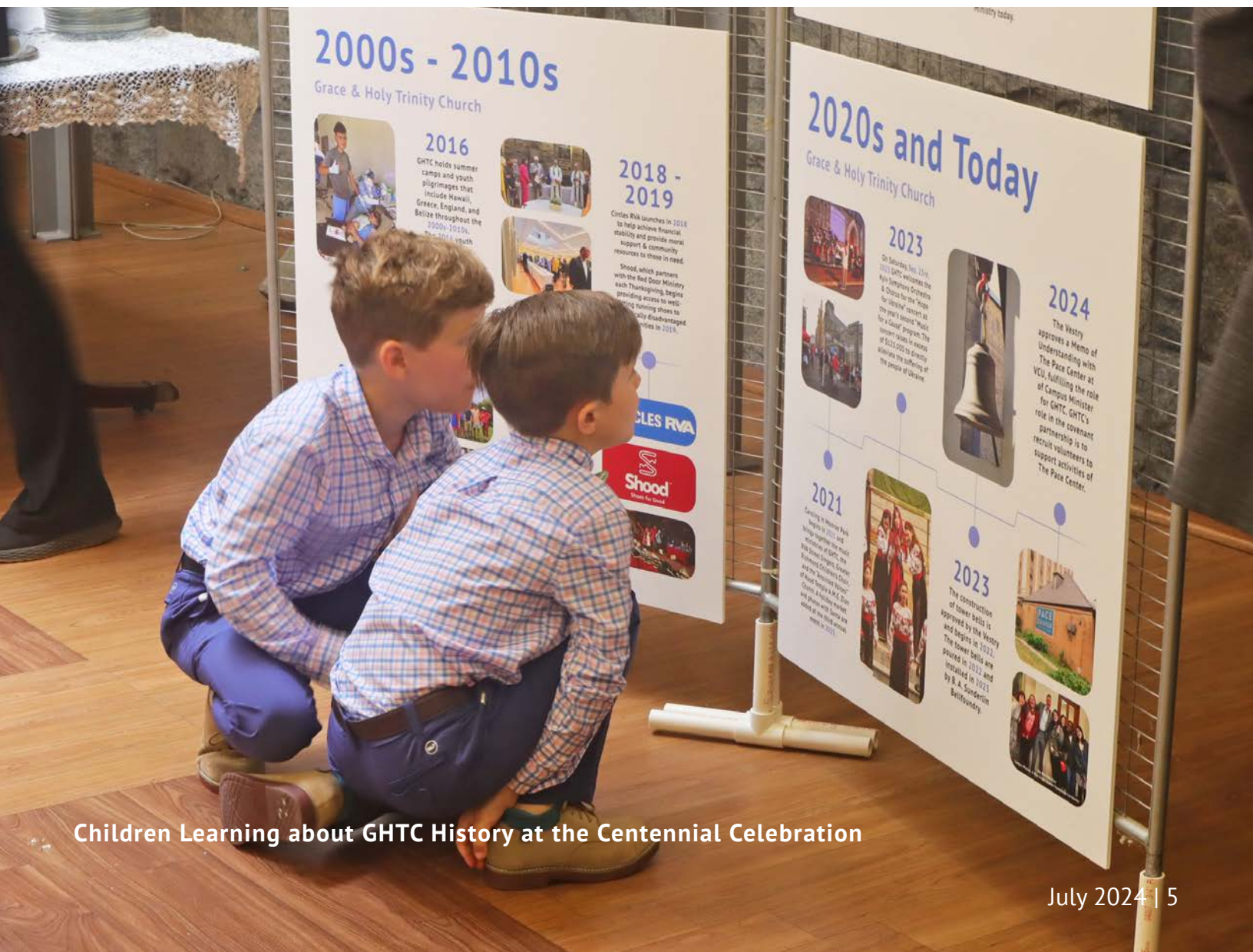
Children Learning about GHTC History at the Centennial Celebration